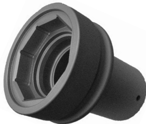
Tool FMB 40

You will find our range of equipment on the back.