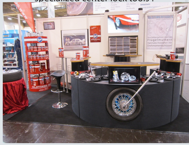
We are present on most major car shows.

We offer these best selling AND many more specialized center lock tools!